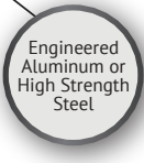
Engineered Aluminum or High Strength Steel