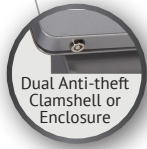
Dual Anti-theft Clamshell or Enclosure