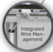
Integrated Wire Management